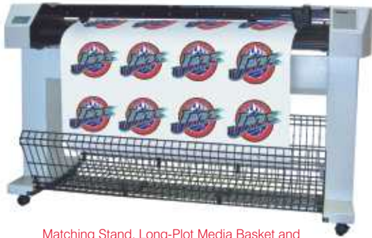
Matching Stand, Long-Plot Media Basket and OPOS Optical Positioning System are all standard equipment on DuraSign. Tangential cutting head pictured is optional.

DuraSign was designed as the companion cutter to our extra-wide DuraChrome sign printer, but it's right at home in high volume vinyl production departments as well. In fact, the all new DuraSign cutter screams "high volume output!" From an extra-wide 134.5cm cutting width, to guaranteed repeatability on single plots up to 12 metres long, DuraSign can handle the largest projects with unparalleled ease and efficiency.